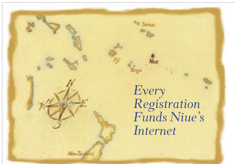
Internet users in Niue benefit from the .NU domain name's association with the tiny island. Located 2,400 km northeast of New Zealand, Niue is the first nation in the world to have free Internet connectivity for its 1,800 citizens via satellite link. The Internet Users Society—Niue, a private charitable foundation funded by .NU registration fees, offers free dial-up services to everyone in Niue and free broadband connectivity for Niueans without PCs at its Internet Cafe.